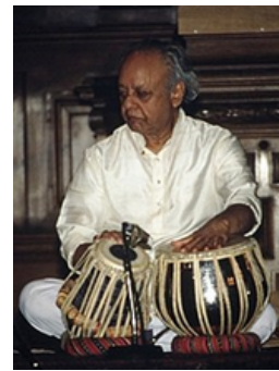
Ustad Alla Rakha Khan Qureshi