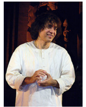
Ustad Zakir Hussain